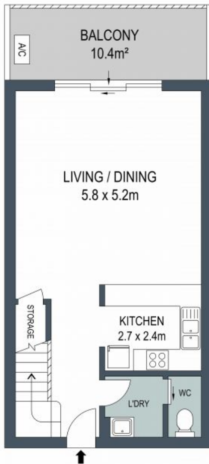
ELEVATED GROUND FLOOR