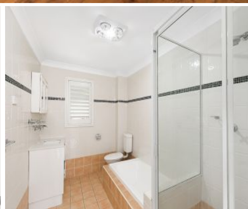
1/1-3 Hughes Street Woolooware, NSW