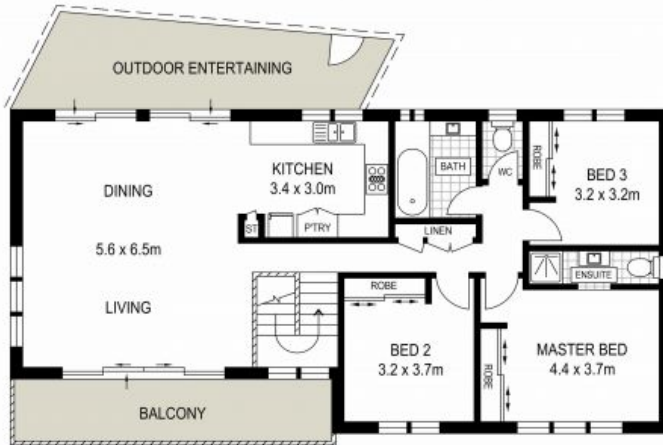
ELEVATED GROUND FLOOR