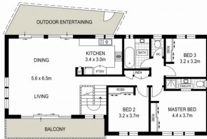
ELEVATED GROUND FLOOR