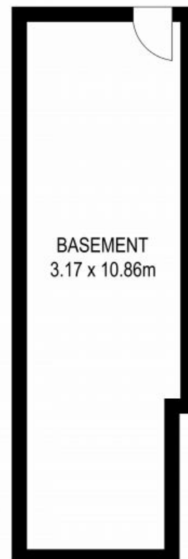
BASEMENT 3.17 x 10.86m