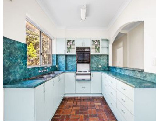
3/12-14 Kiora Road Miranda, NSW