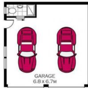
GARAGE 6.8 x 6.7m