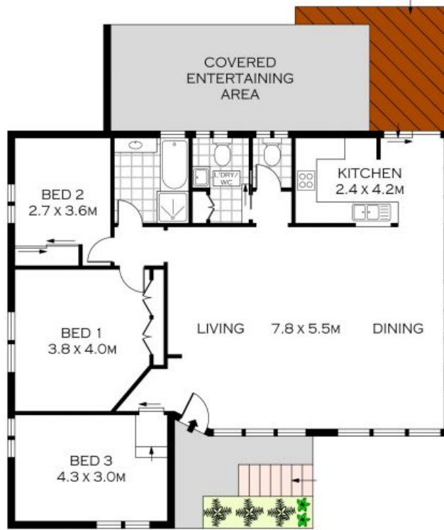
ELEVATED GROUND FLOOR