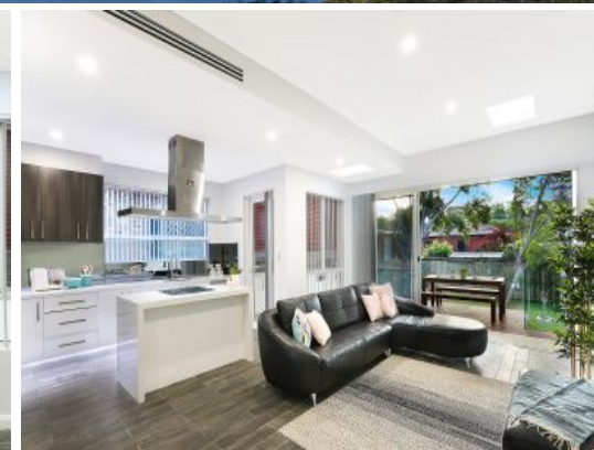
147B Corea Street Miranda, NSW