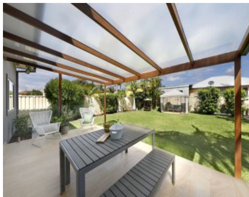
164 Parraweena Road Miranda, NSW