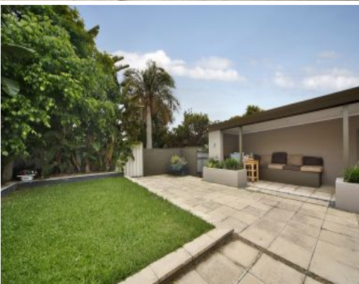
265a Cooriengah Heights Road Engadine, NSW