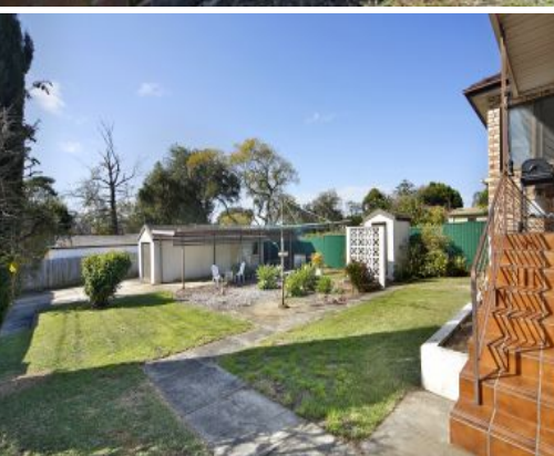
65 Snowden Avenue Sylvania, NSW